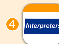
LanguageLine InSight Video App Icon